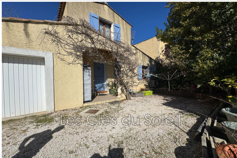
Villa Le Pradet

House in the city center of Pradet a few minutes walk from all local shops, schools, arts center. House located at the end of a dead end in the quiet of any busy road. It will seduce you with its spacious living room opening onto an open kitchen and followed by its veranda. You will find on the ground floor a bedroom with closet, a separate toilet, a bathroom with shower. Upstairs two bedrooms with closet (13m 2 and 10m 2 ) and a toilet. The house also has a large 24m 2 garage. A minimalist garden to enjoy a moment of relaxation away from prying eyes. THE KEYS OF THE SUN 04.94.46.27.27 Ref. : 501V47108M - Mandat n°13148